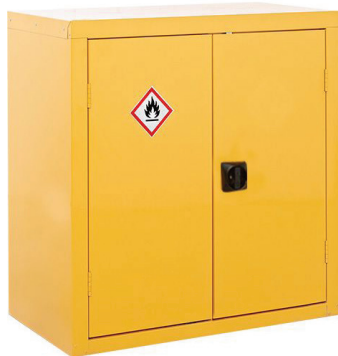
TUFF COSHH Cupboard H1800 x W900 x D460mm