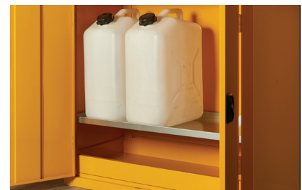
Adjustable Spill Retaining Galvanised Shelf